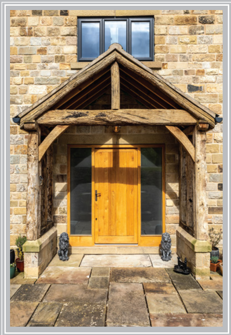
Woodland Troway, Sheffield