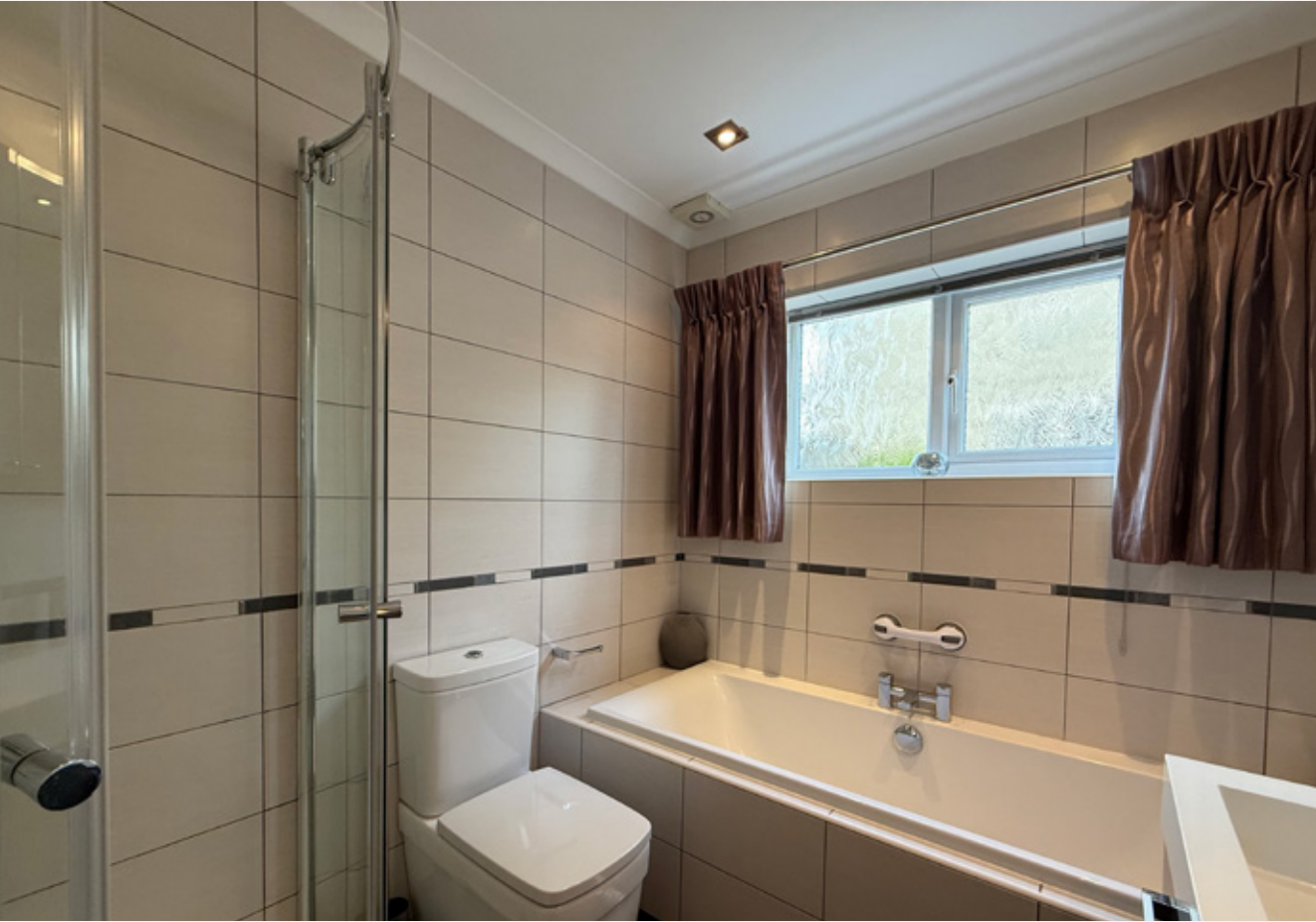
MASTER EN-SUITE BATHROOM

From the inner hallway, a staircase with a hand rail and balustrading rises to the first floor.