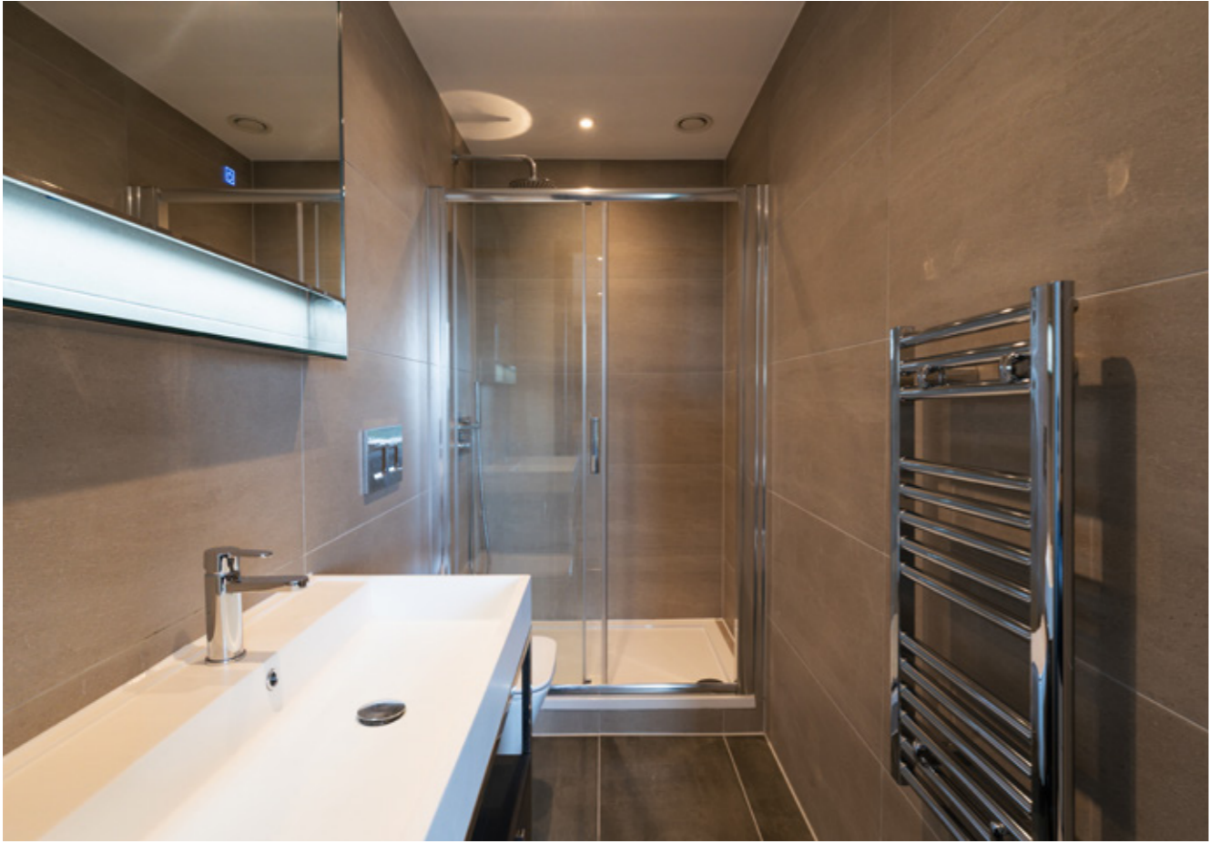
MASTER EN-SUITE SHOWER ROOM