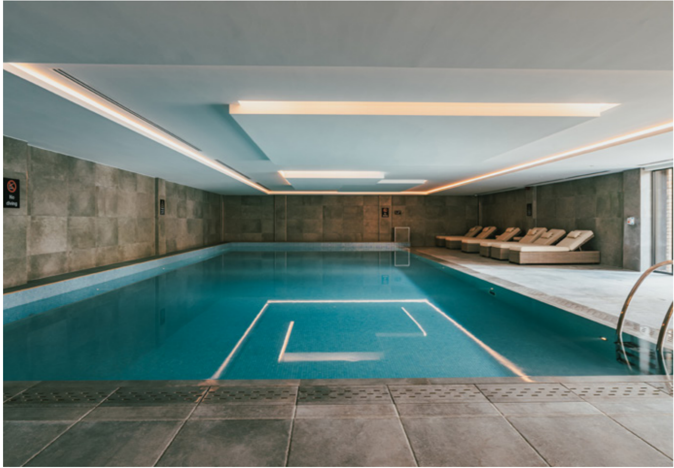
COMMUNAL SWIMMING POOL