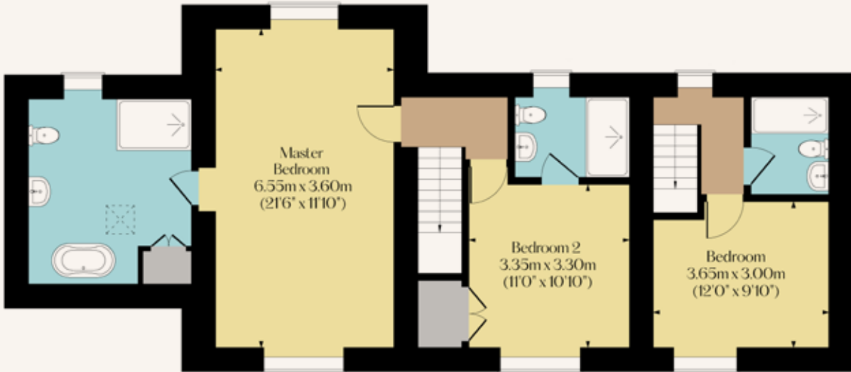
1 Bed Holiday Cottage First Floor

Approximate Floor Area: 913 SQ.FT. (84.8 SQ.M)