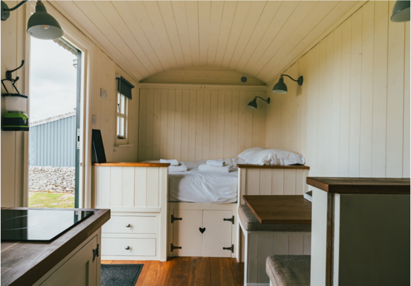
KITCHEN/BEDROOM - SHEPHERDS HUT