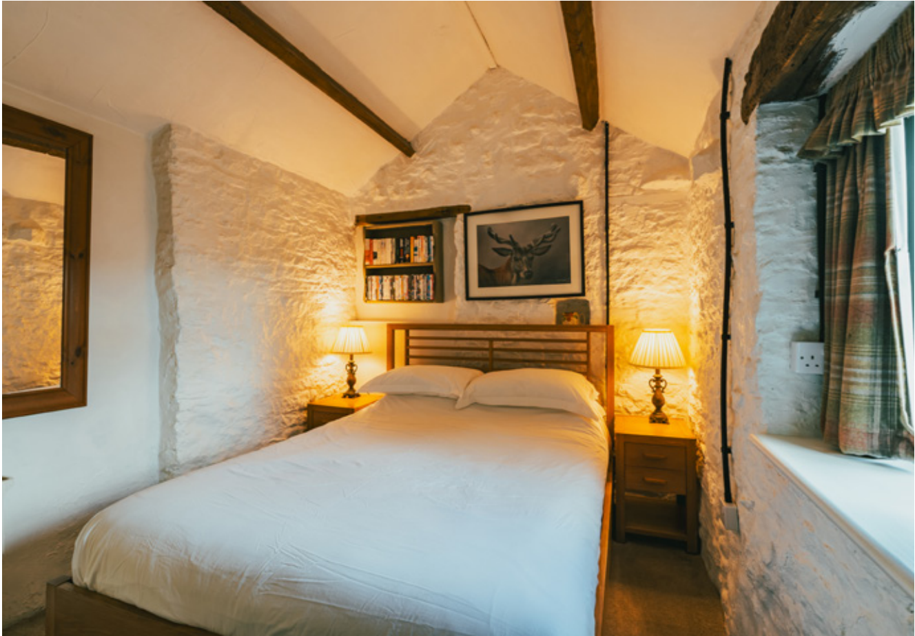
BEDROOM - KEEPERS COTTAGE