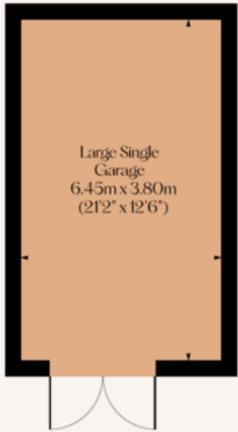
Large Single Garage 6.45m x 3.80m (21'2" x 12'6")