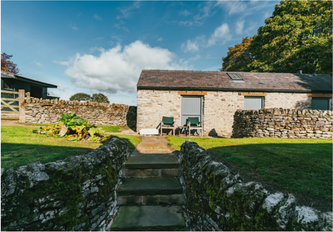
MAIN HOUSE GARDEN