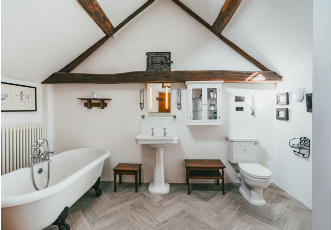
MASTER EN-SUITE BATHROOM