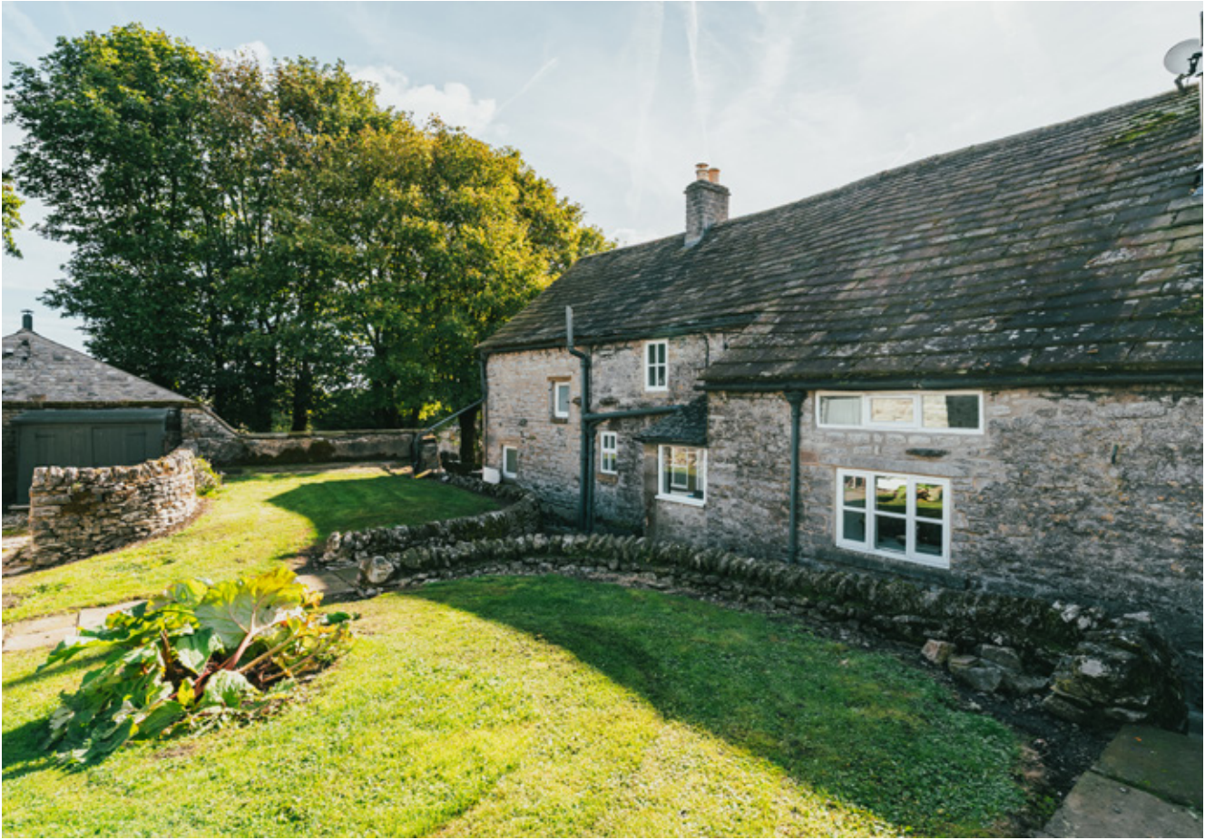
MAIN HOUSE GARDEN