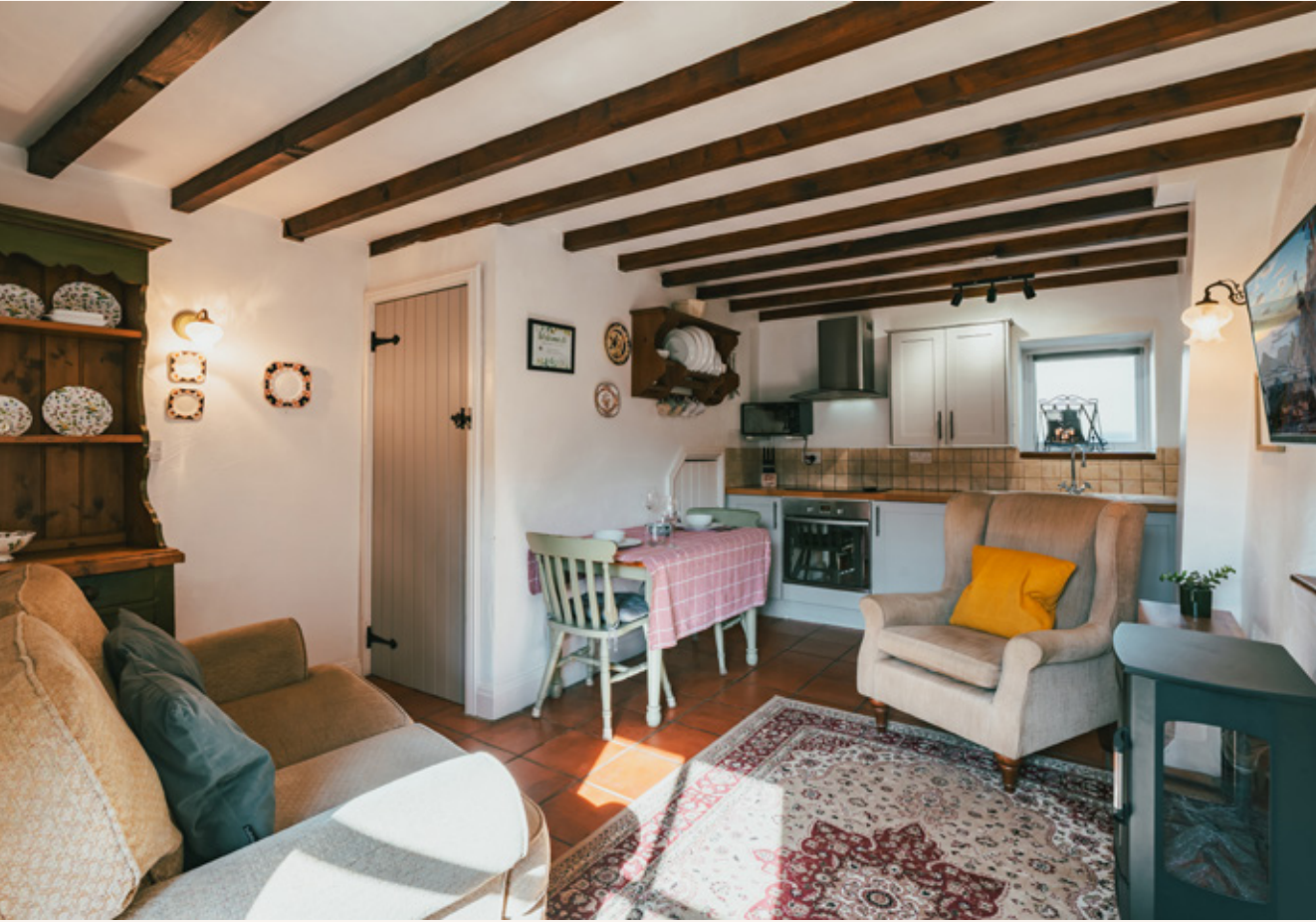
LIVING KITCHEN - HOLIDAY COTTAGE

Having a flush light point, extractor fan, fully tiled walls, chrome heated towel rail and an illuminated vanity mirror. A suite in white comprises a low-level WC and a wall mounted wash hand basin with a chrome mixer tap. To one wall is a walk-in shower enclosure with a fitted Mira shower and a glazed screen/door.