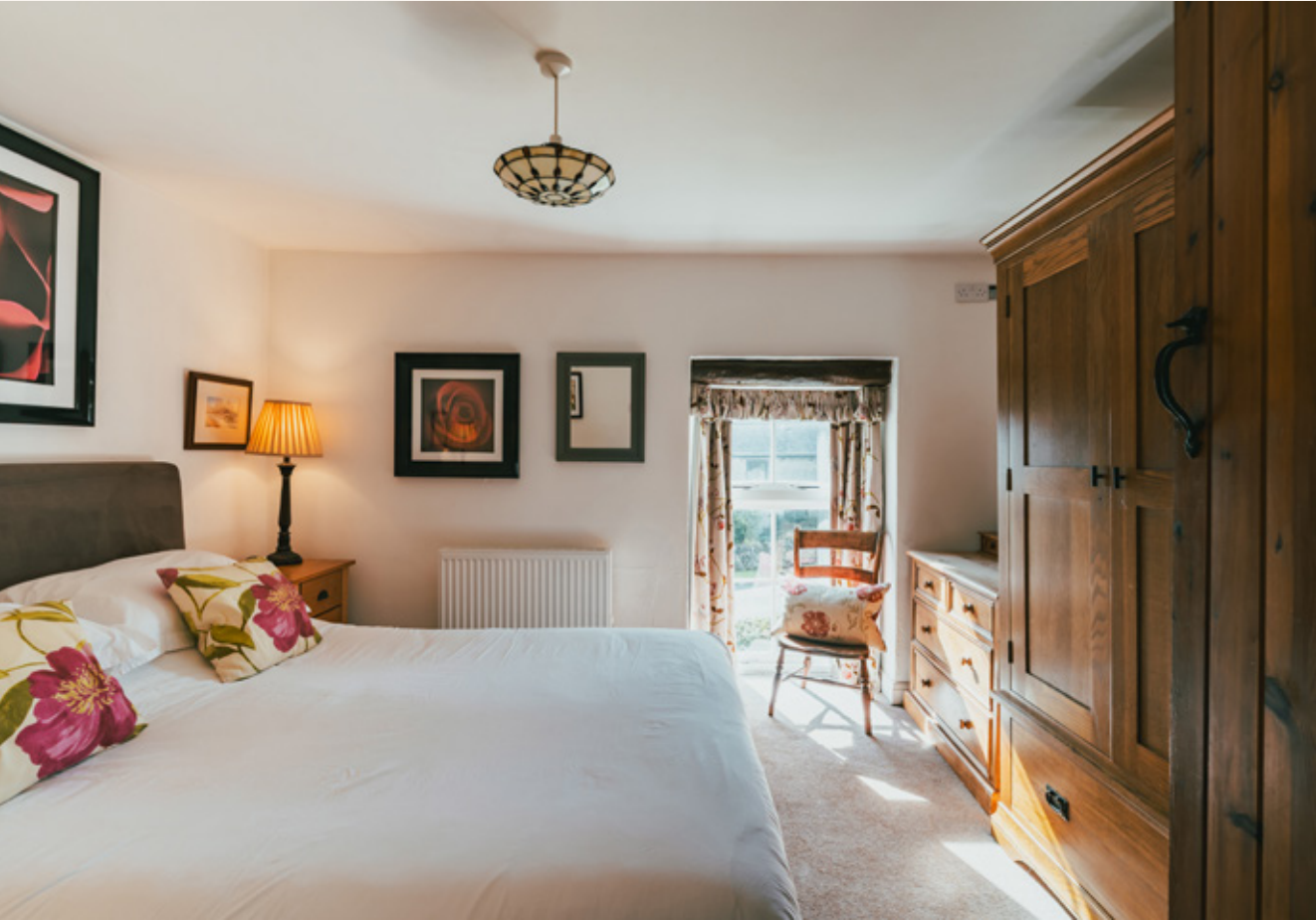
BEDROOM - HOLIDAY COTTAGE