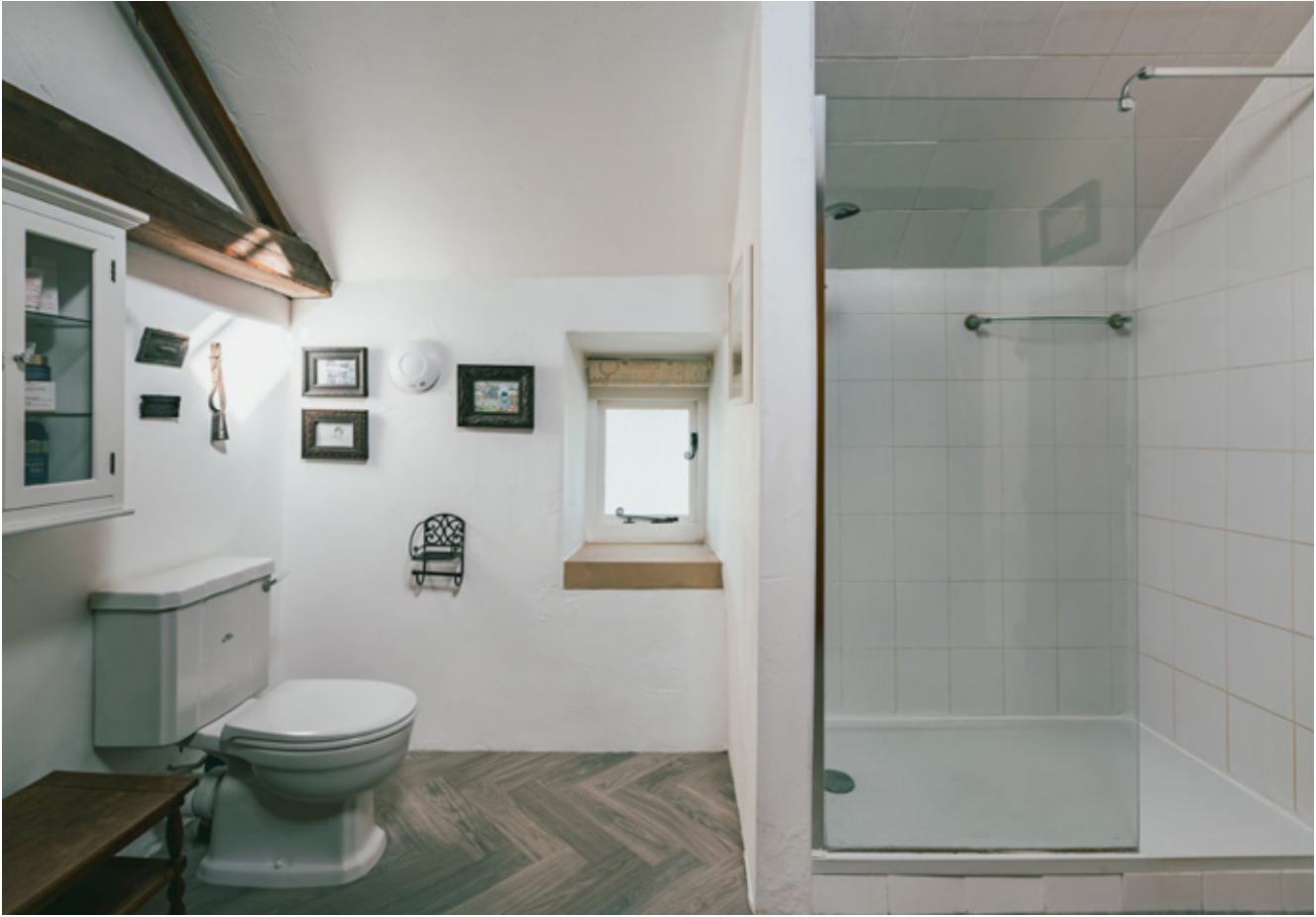
MASTER EN-SUITE BATHROOM