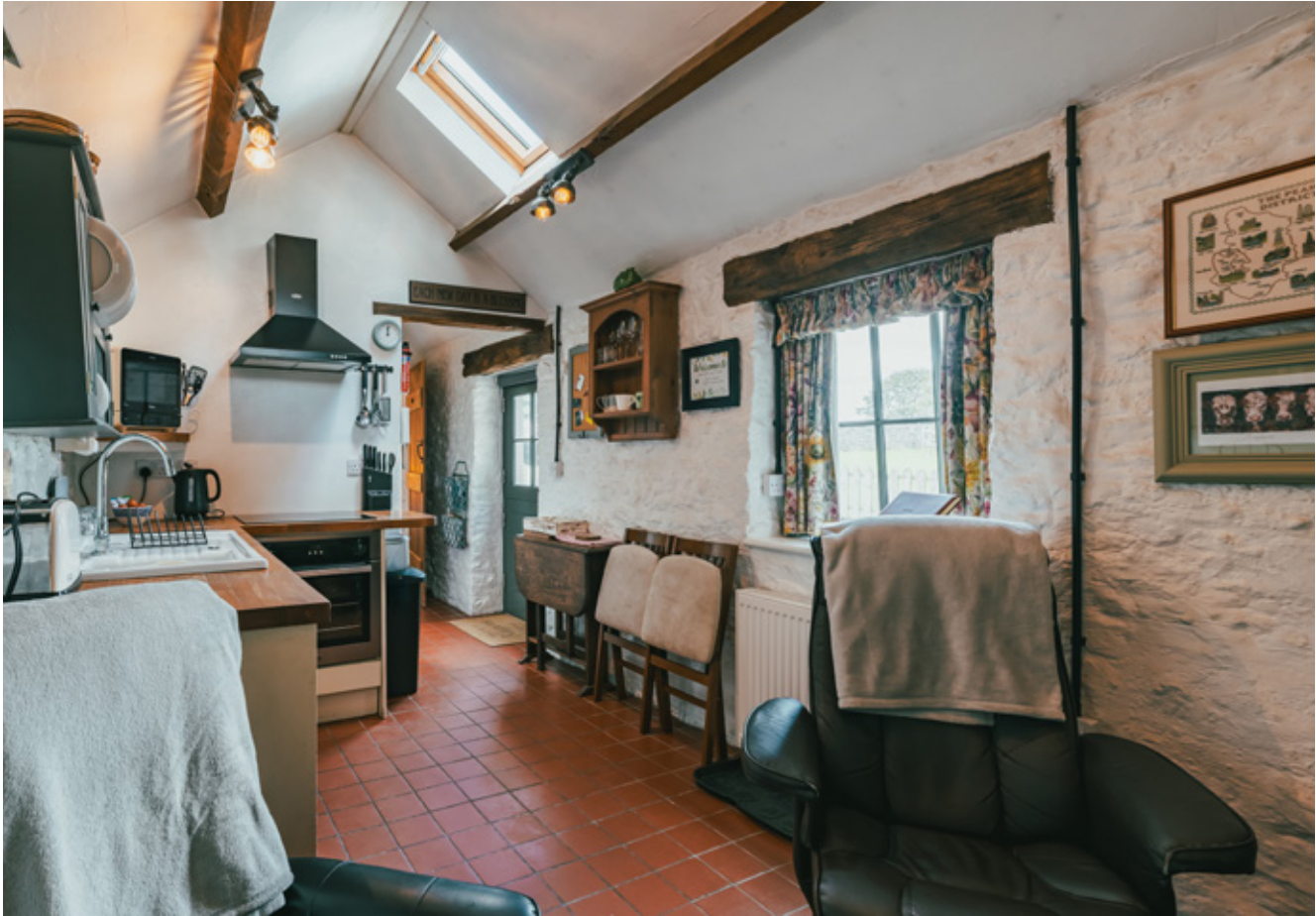
KITCHEN/LIVING AREA - KEEPERS COTTAGE