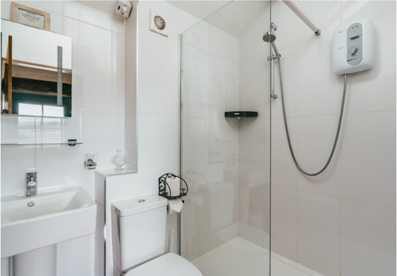
SHOWER ROOM - KEEPERS COTTAGE