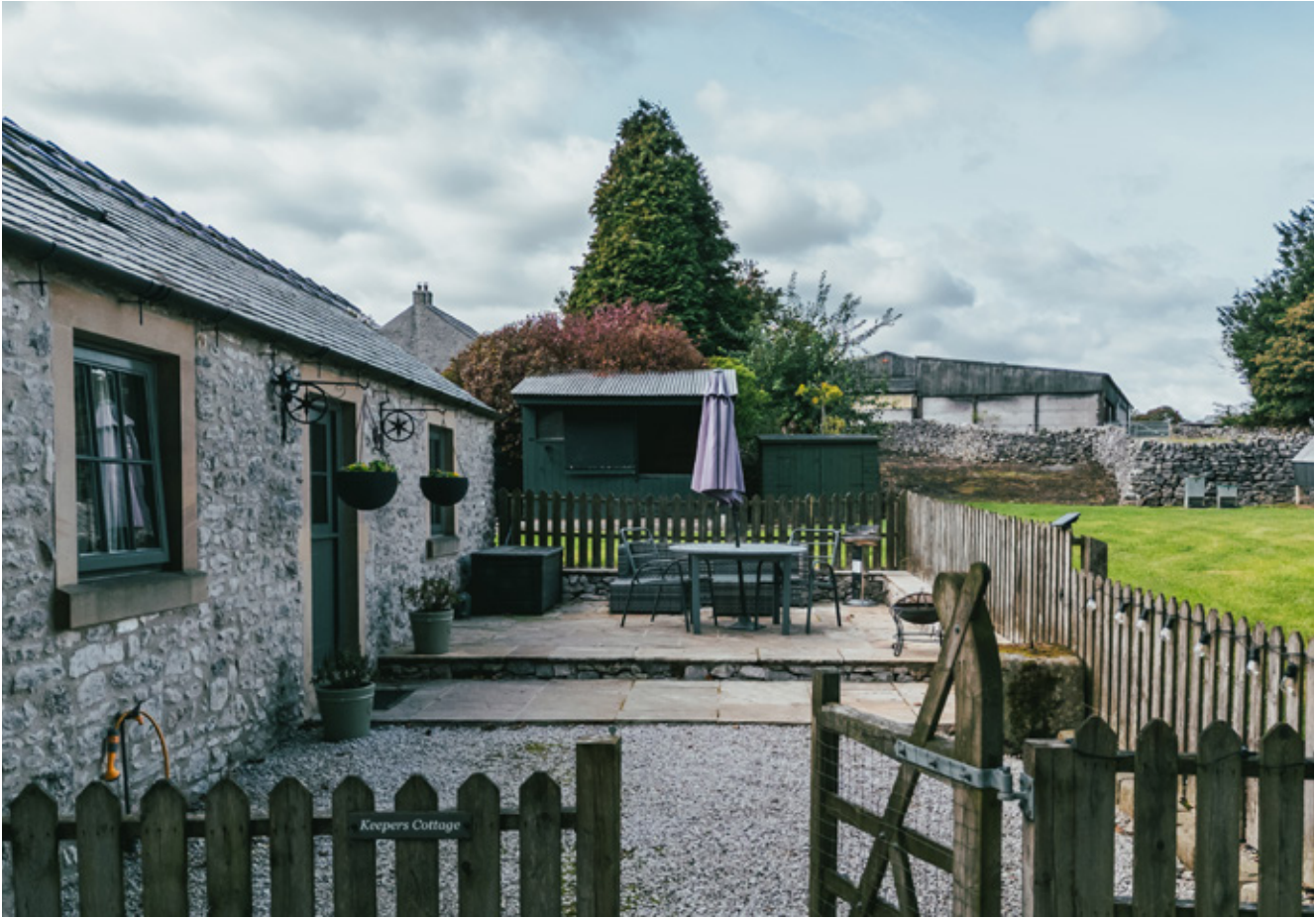
KEEPERS COTTAGE - EXTERIOR