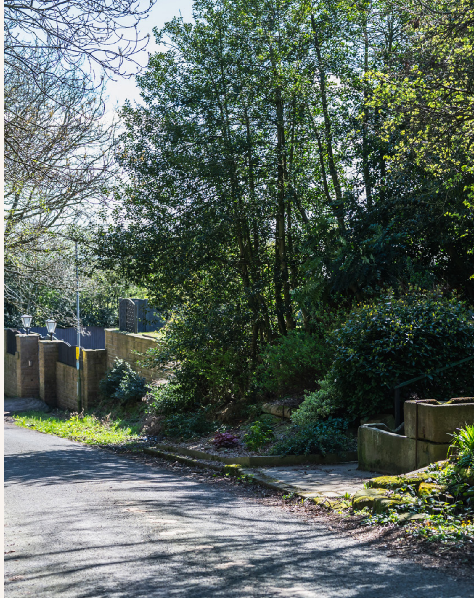
SPOUT HOUSE LANE