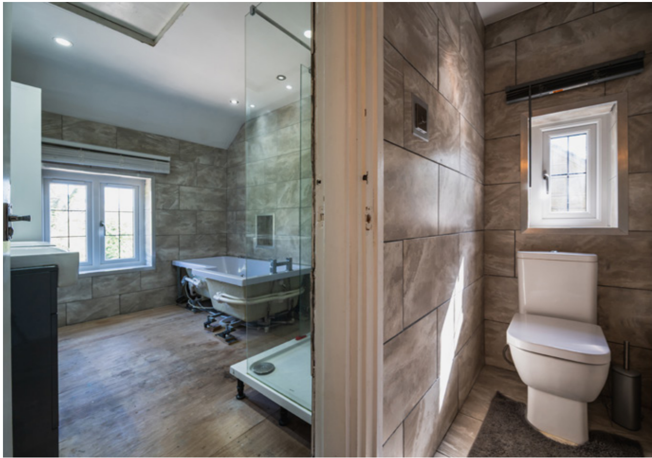
BATHROOM & WC