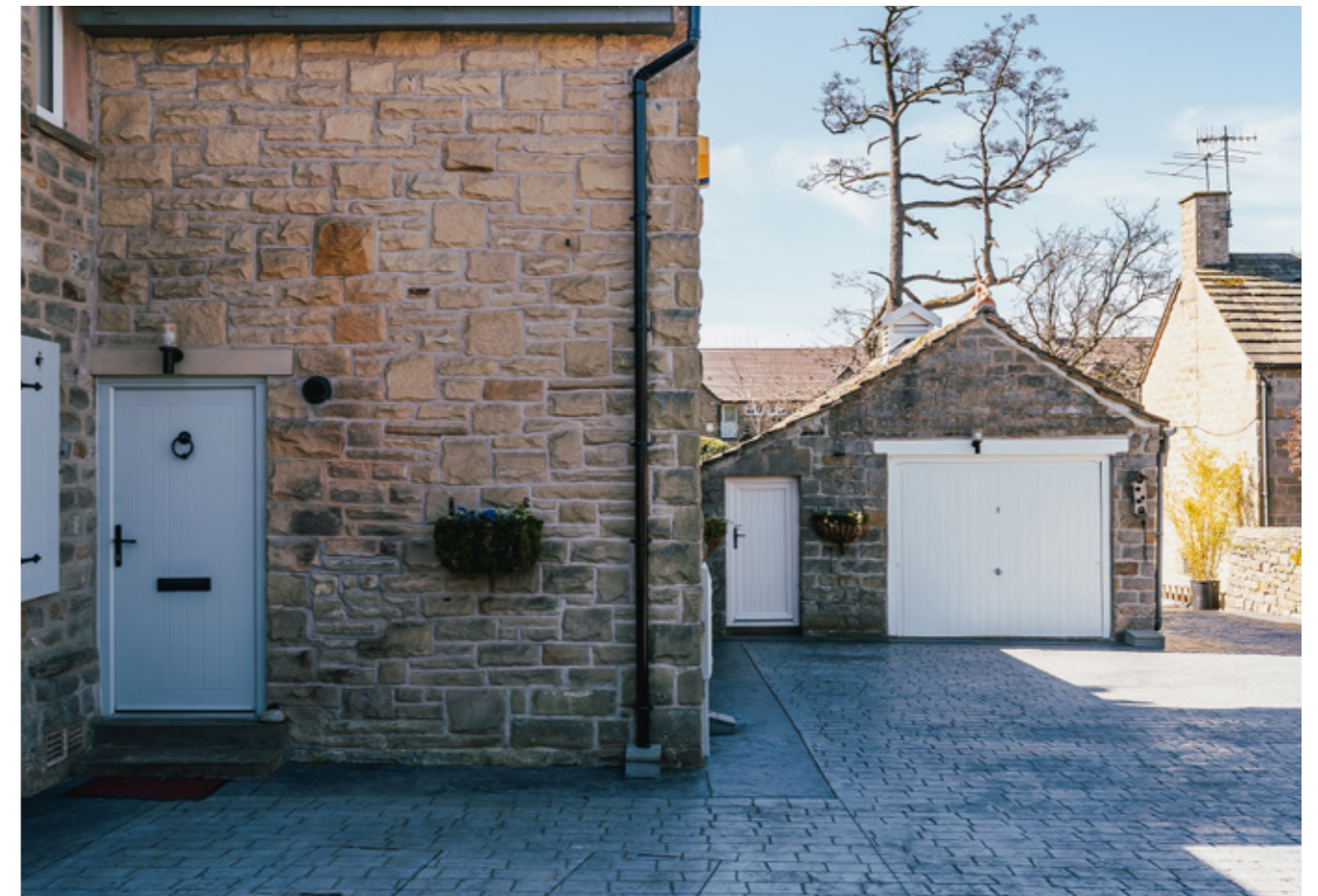
GARAGE & STORE