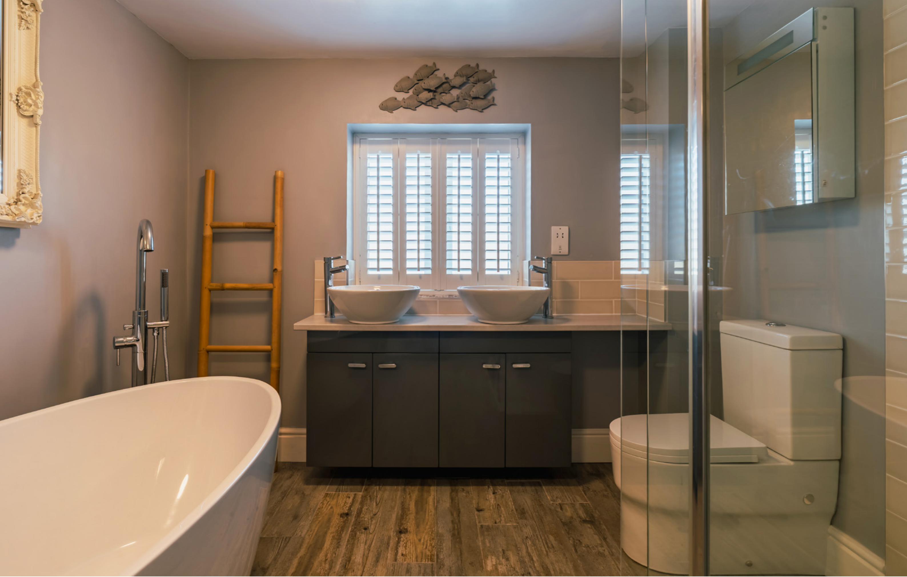
MASTER EN-SUITE BATHROOM