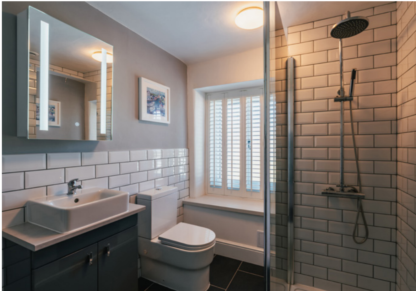
FAMILY SHOWER ROOM