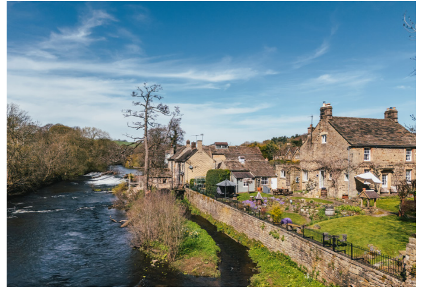
RIVER DERWENT, BASLOW