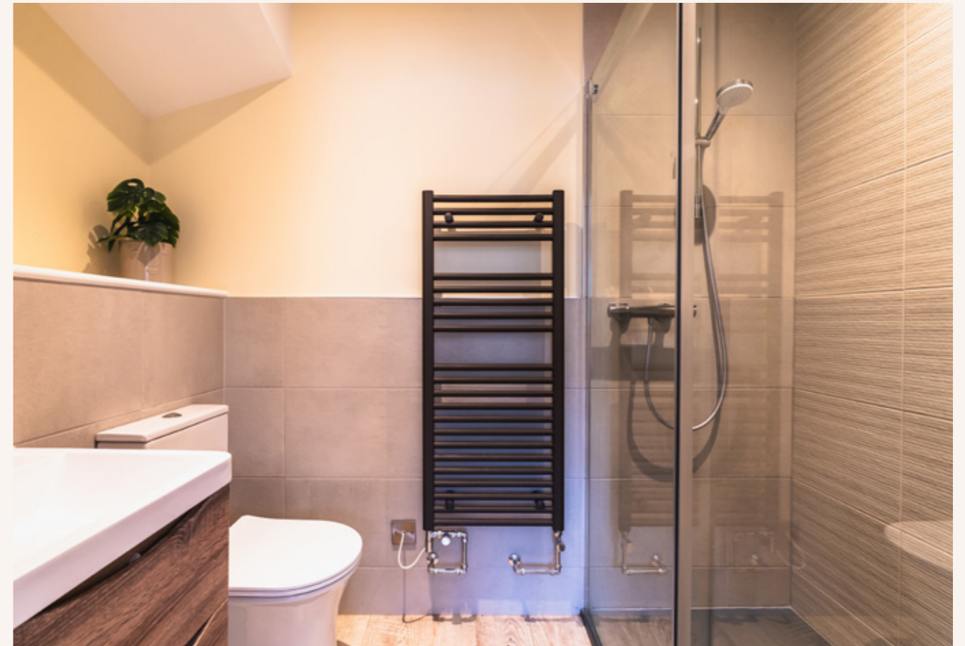
BEDROOM 4 EN-SUITE SHOWER ROOM