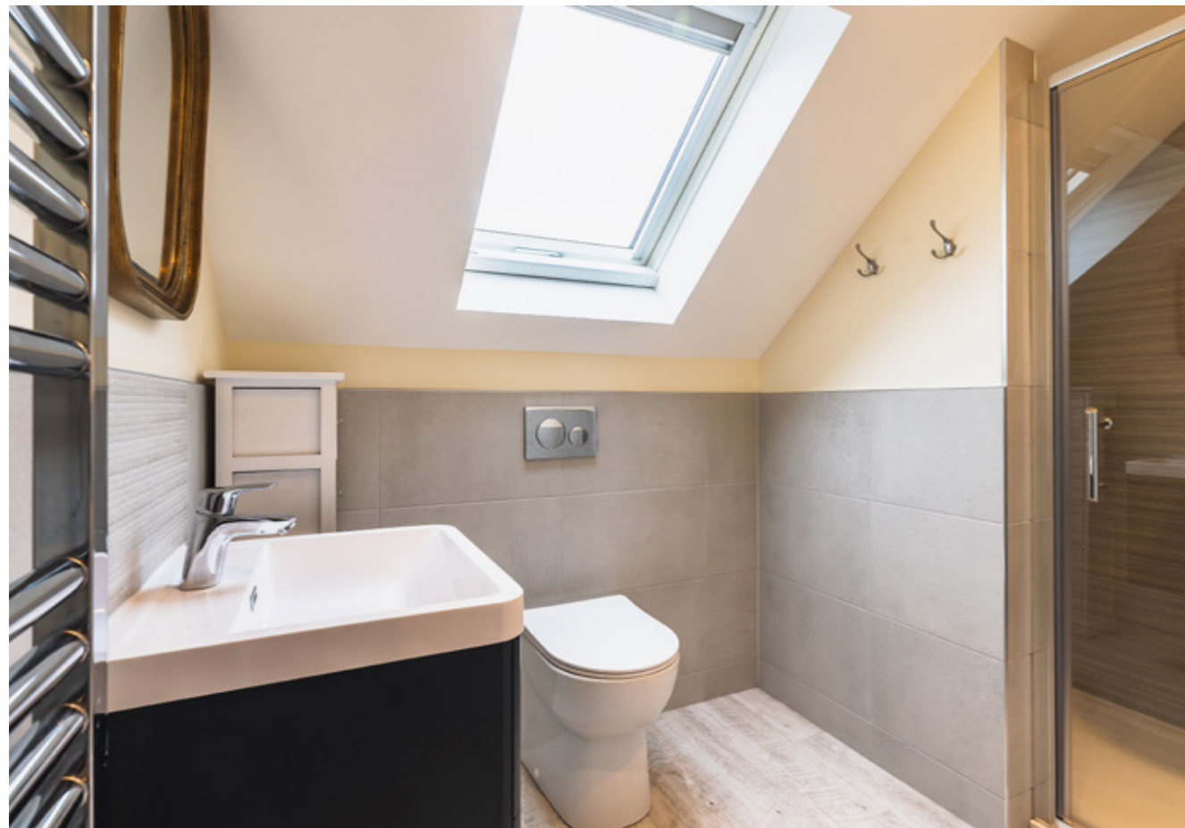
BEDROOM 3 EN-SUITE SHOWER ROOM