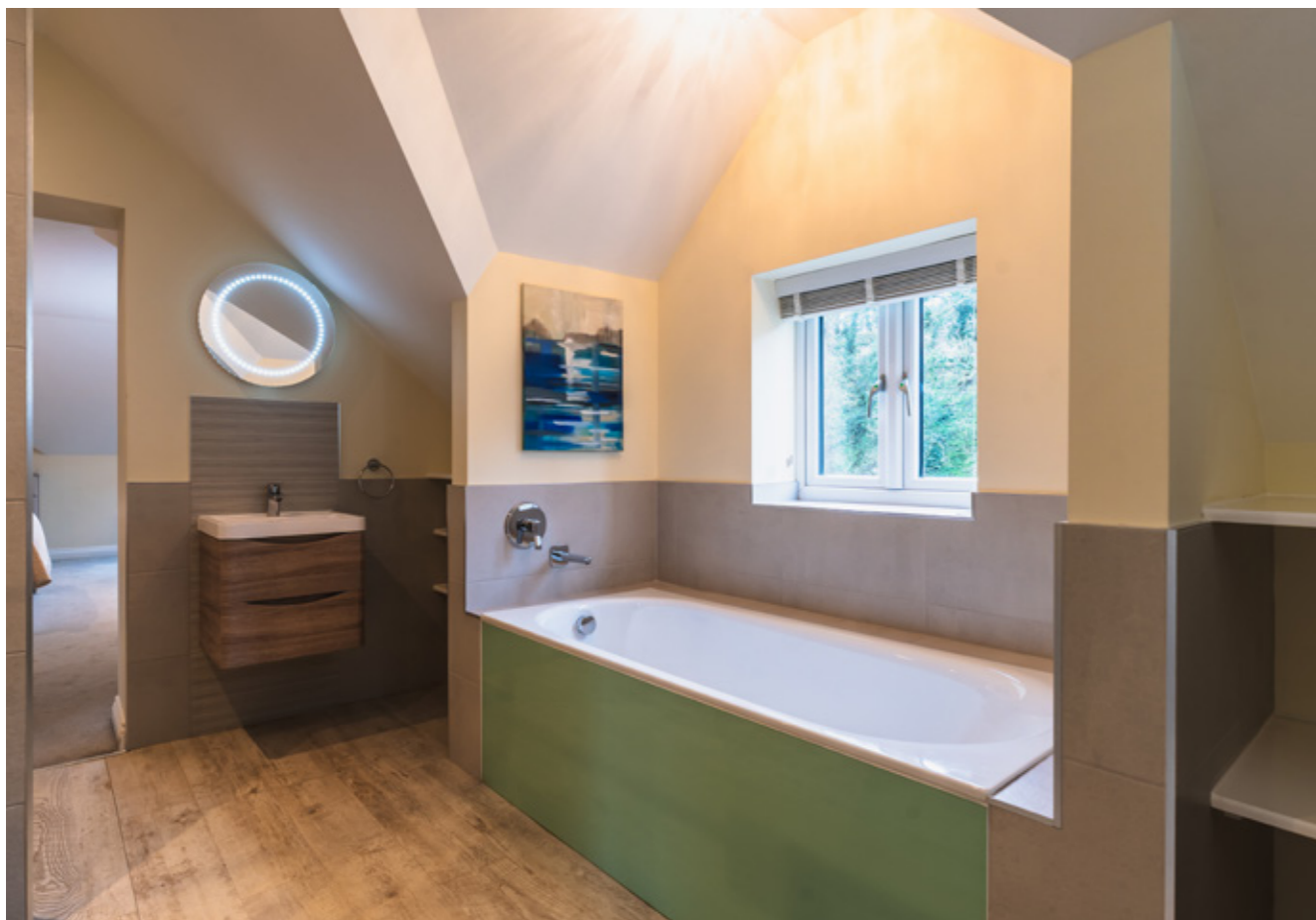
MASTER EN-SUITE BATHROOM