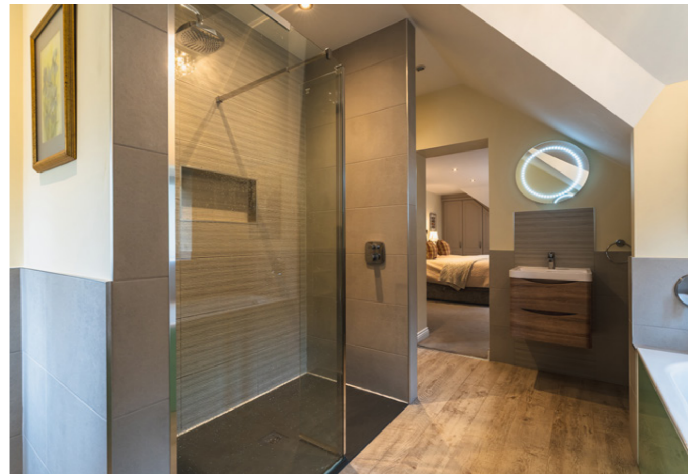
MASTER EN-SUITE BATHROOM