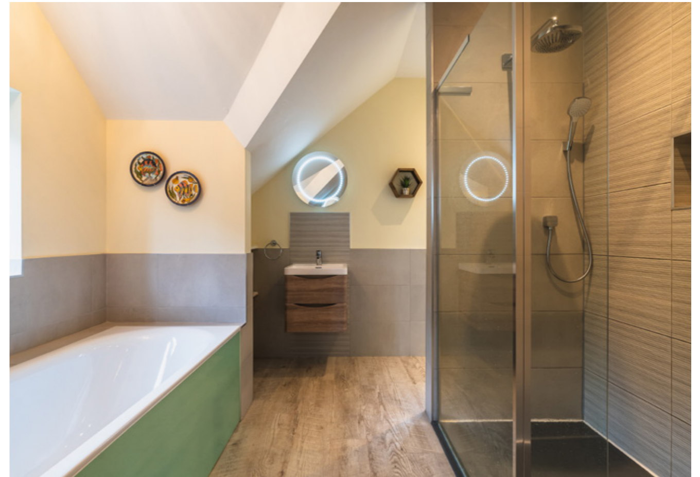
MASTER EN-SUITE BATHROOM