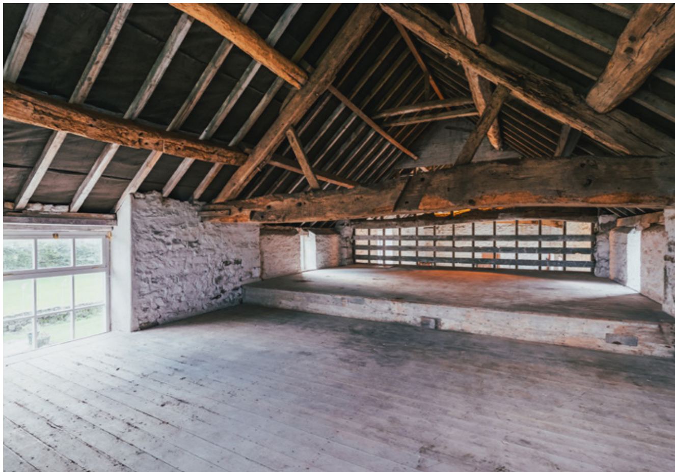
BARN 2 - ROOM 3