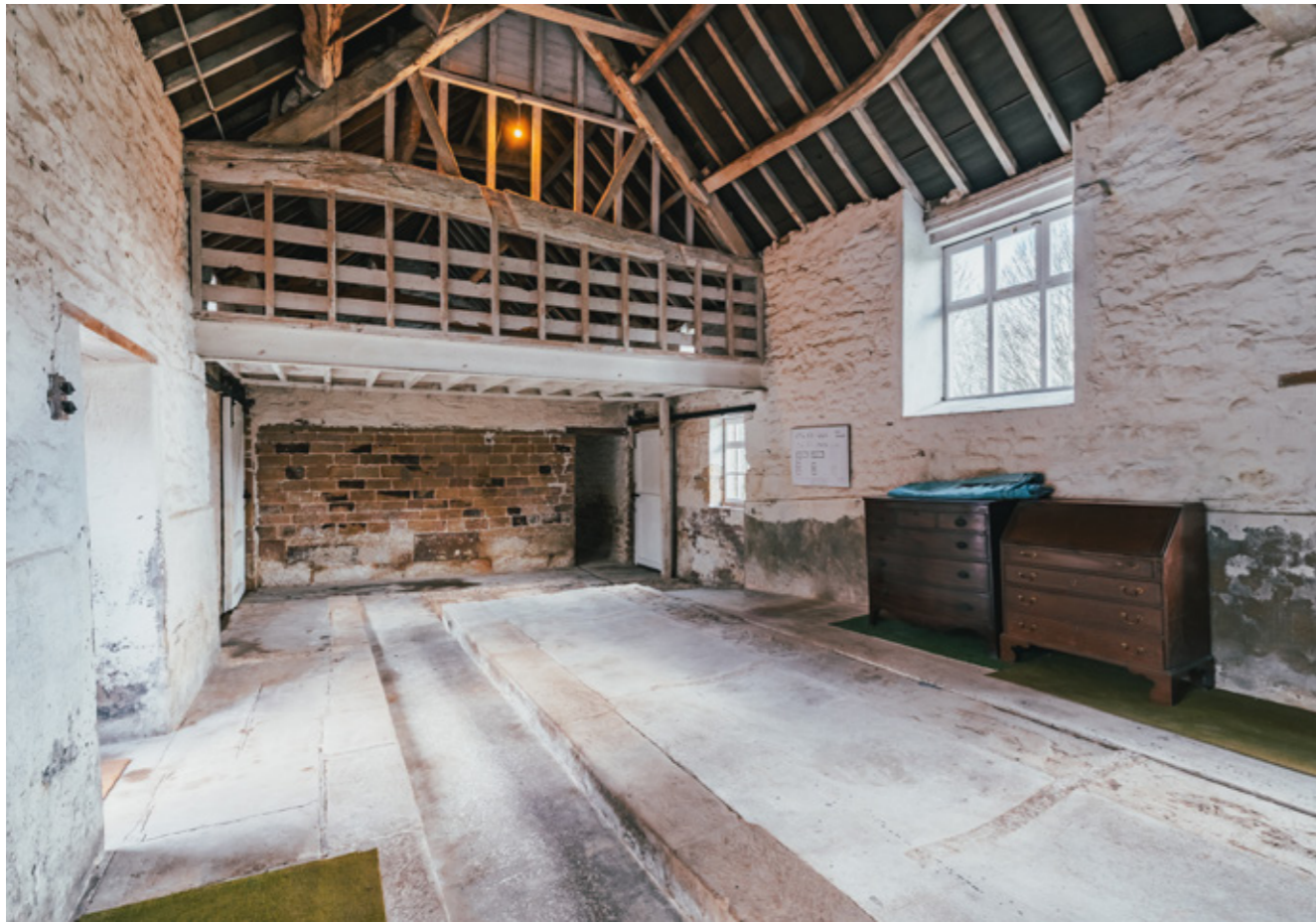
BARN 2 - ROOM 1