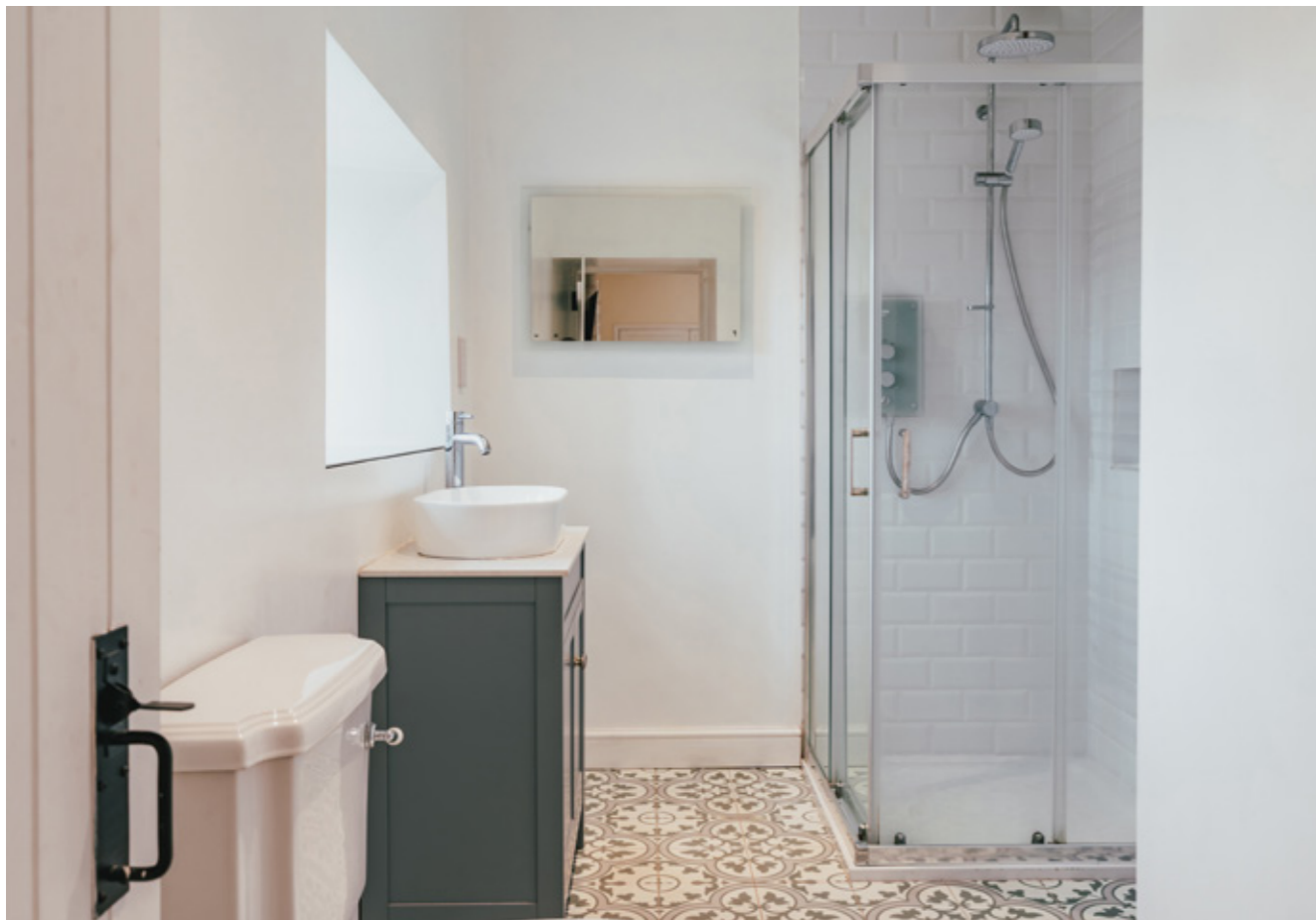
MASTER EN-SUITE SHOWER ROOM