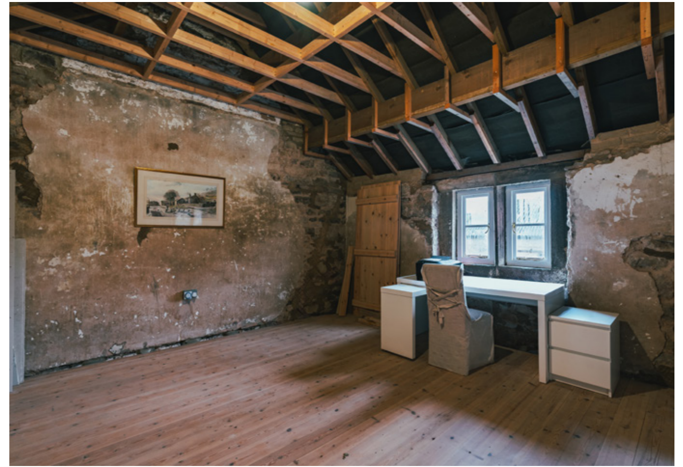
BARN 1 - BEDROOM 1