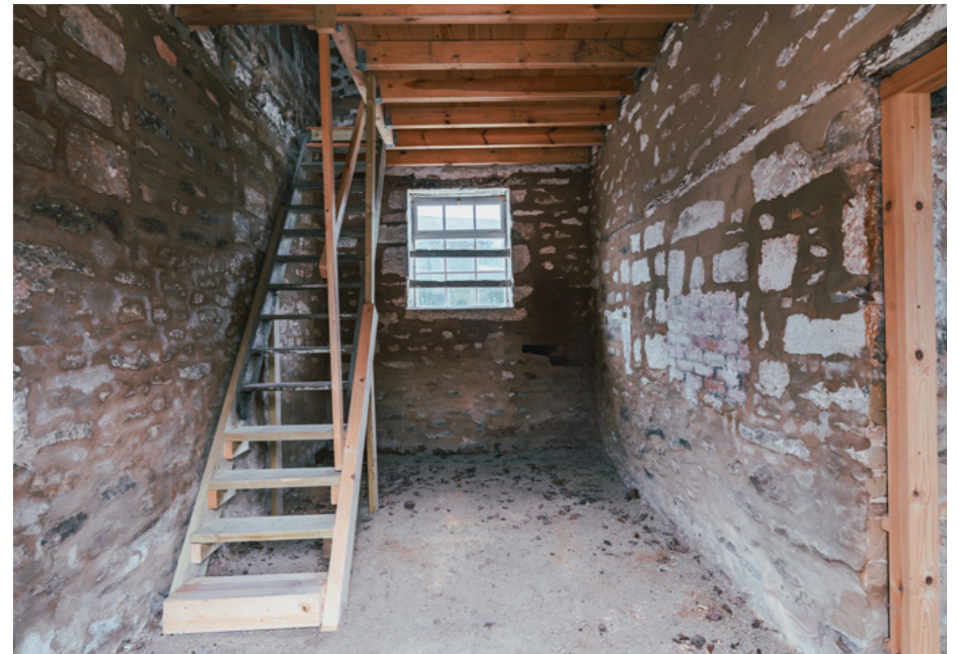
BARN 1 - DINING HALL