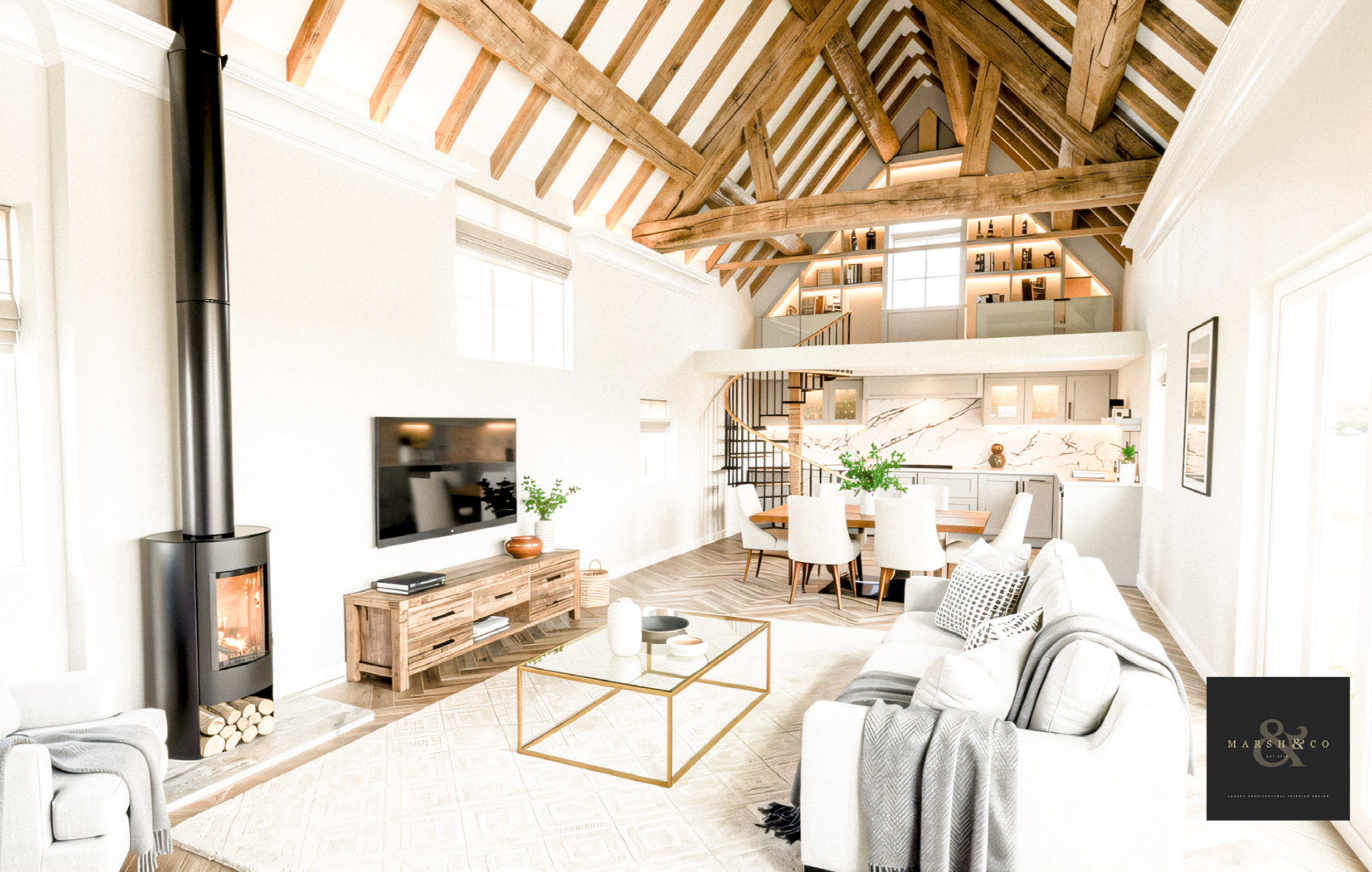
COMPUTER GENERATED IMAGE OF ROOM 1 IN BARN 2