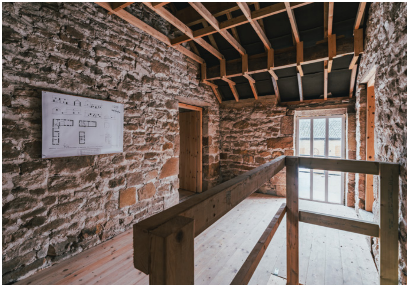
BARN 1 - LANDING