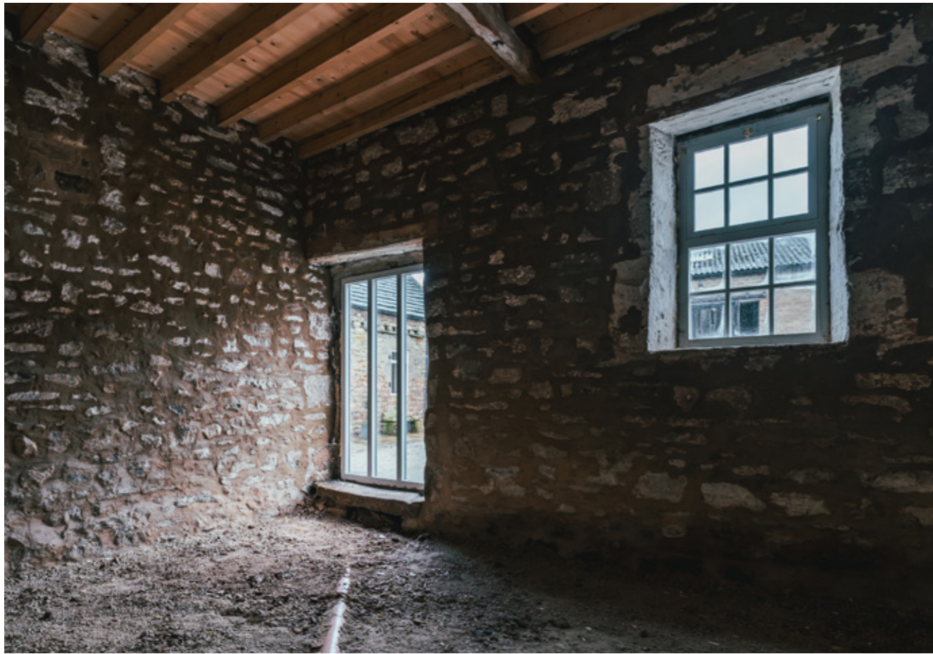
BARN 1 - KITCHEN