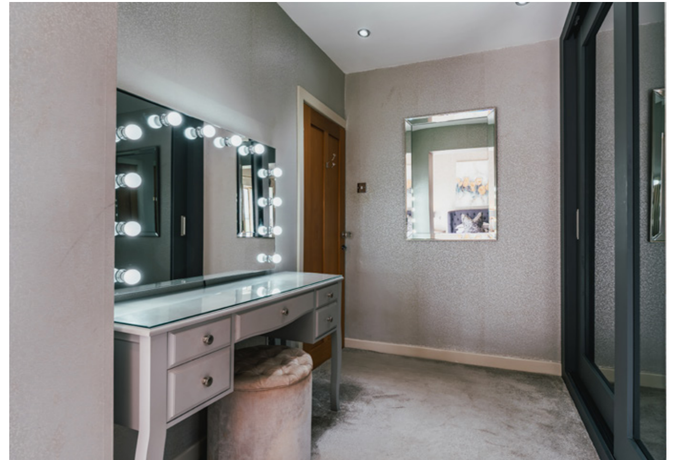
MASTER DRESSING ROOM