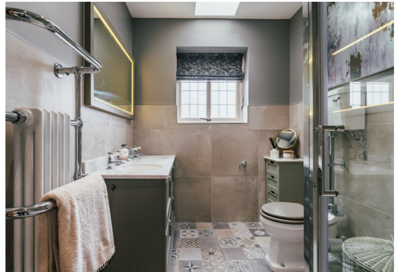
MASTER EN-SUITE SHOWER ROOM