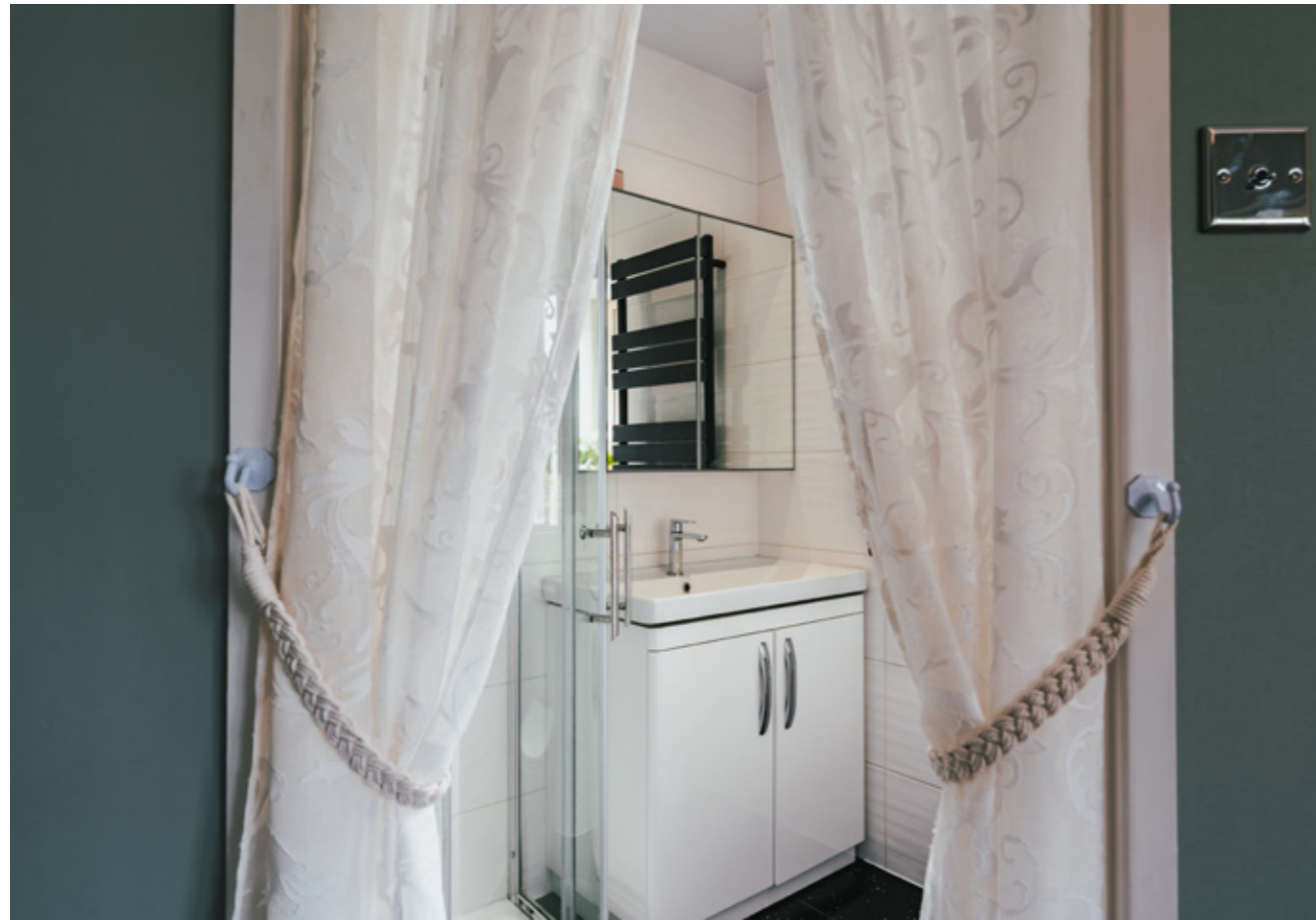
BEDROOM 2 EN-SUITE SHOWER ROOM