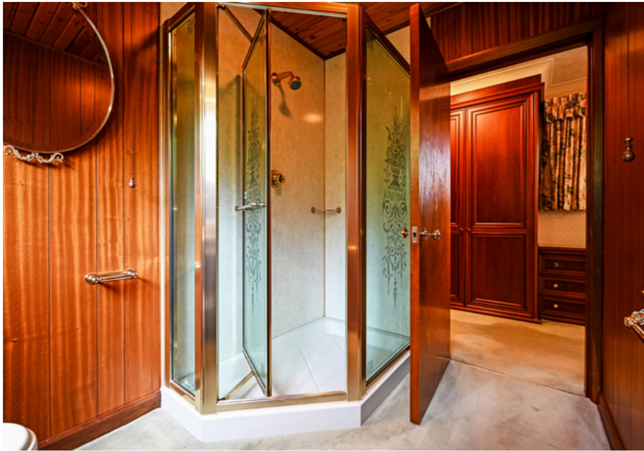
MASTER EN-SUITE SHOWER ROOM