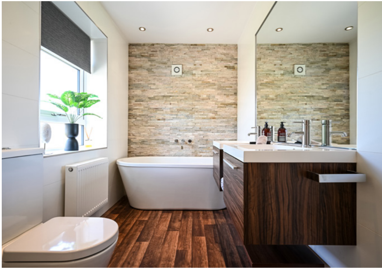
MASTER EN-SUITE BATHROOM