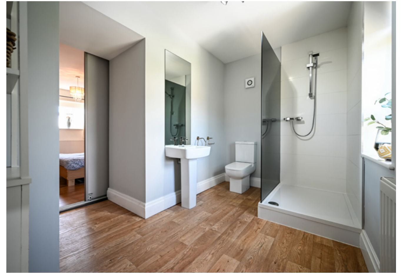
BEDROOM 2/3 EN-SUITE SHOWER ROOM