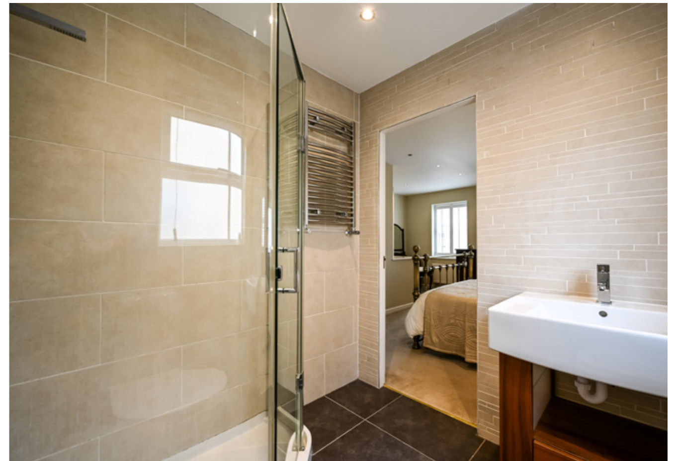
MASTER EN-SUITE SHOWER ROOM