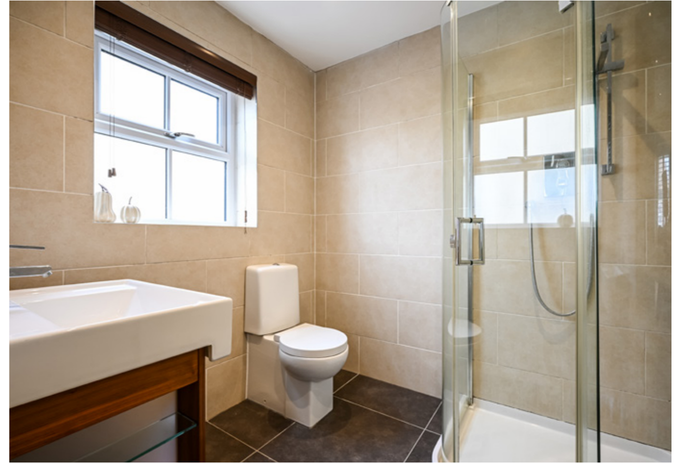
MASTER EN-SUITE SHOWER ROOM