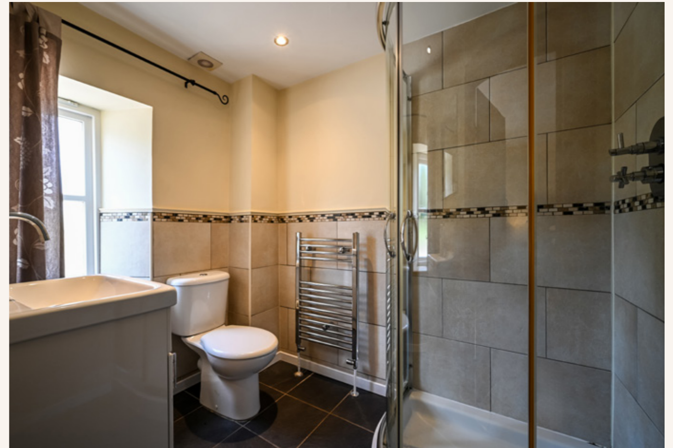
BEDROOM 5 EN-SUITE SHOWER ROOM