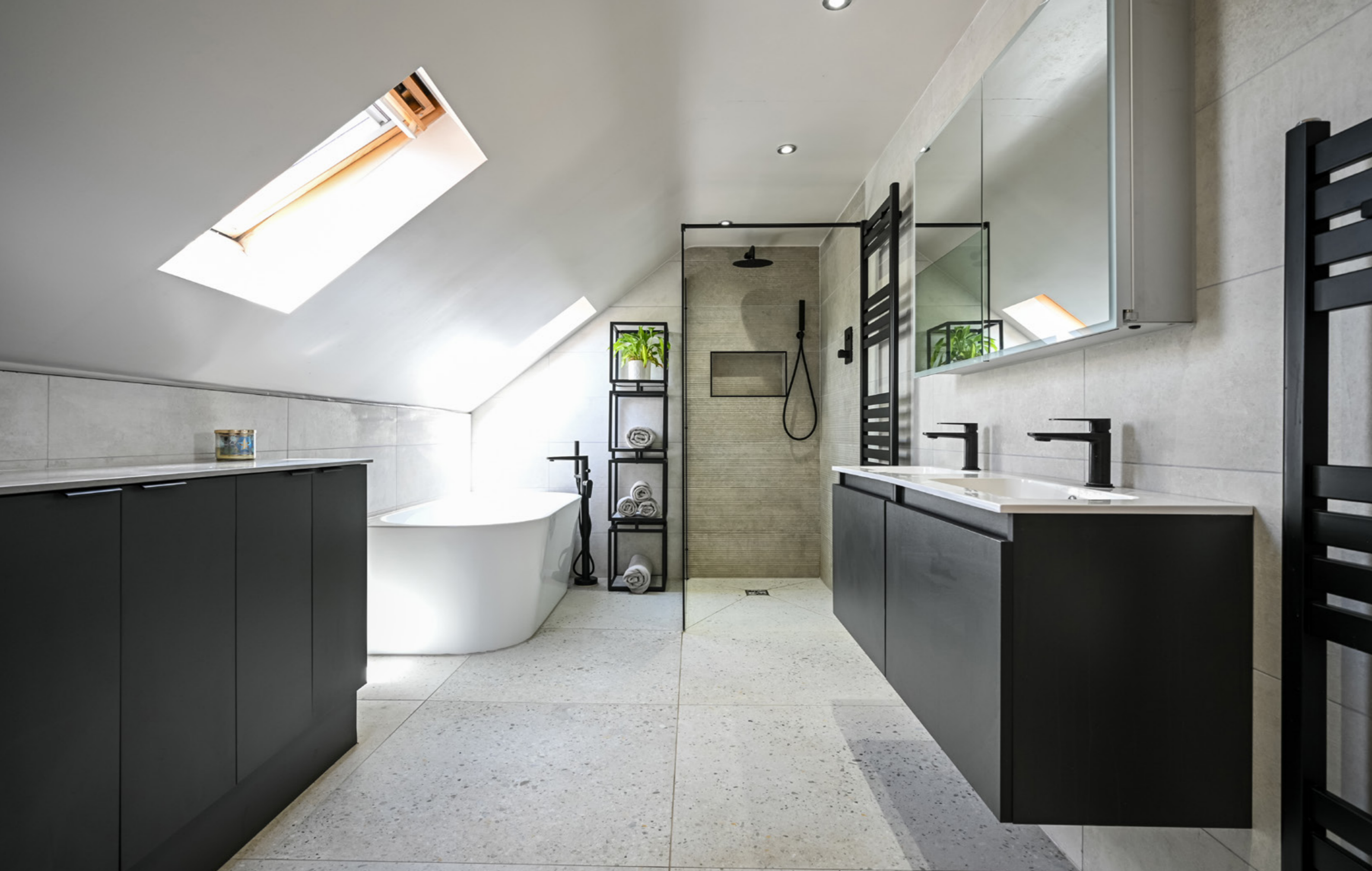
MASTER EN-SUITE BATHROOM