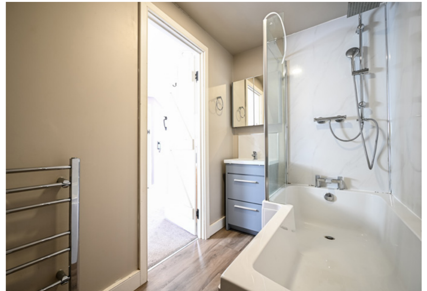
BEDROOM 2 EN-SUITE SHOWER ROOM